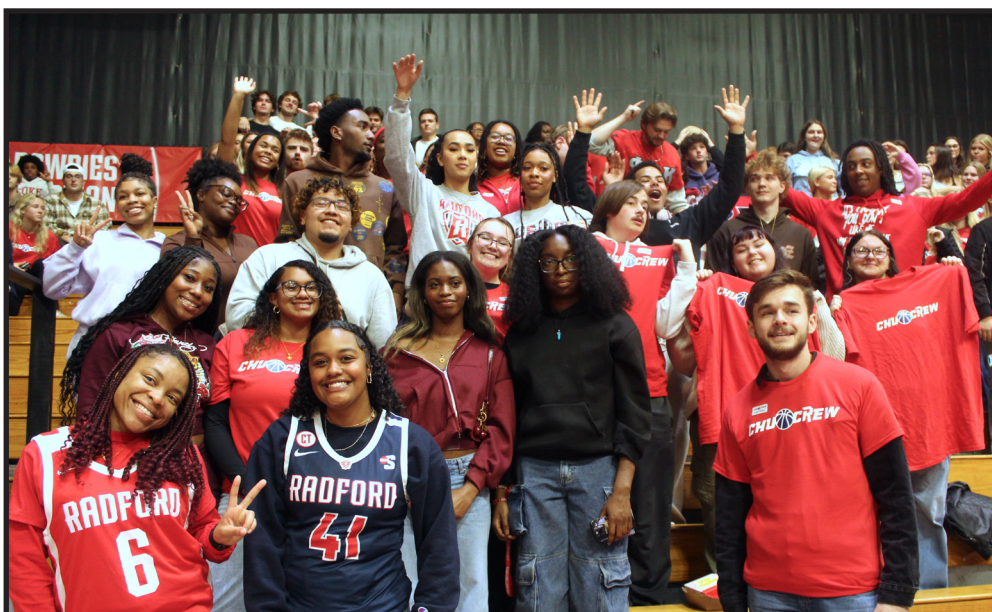
The “Chu Crew” in the student section

“It meant everything and I say that because we told these guys before the game they showed up on June 9th. We got a brand new staff who generally haven’t worked together. A brand new team of guys who have never played together and not one of these players have played for me...to lose the lead in the second half to go down in the game and to come together as a team...it’s what we talk about- everyday, it’s who we are and who