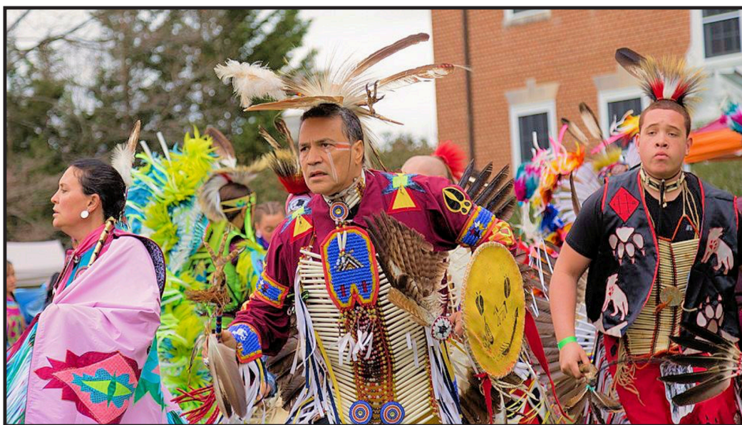
2019 Virginia Tech Spring Powwow

Tribal communities are uncomfortable places to live, often overcrowded, under-