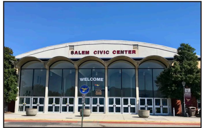
Salem Civic Center

Dylan Marlowe . Marlowe is best known for his hit “Boys Back Home” with Dylan Scott , which reached number two on the Country Airplay Chart. To round out the year, Weird Al Yankovic will bring his Bigger & Weirder Tour to Salem on October 7. He is best known for parodies such as “Amish Paradise” (parody of “Gangsta’s Paradise”), “White & Nerdy” (parody of “Ridin,”), and “Eat It” (parody of “Beat It”). Yankovic has won five Grammy Awards during his career including Best Comedy Recording for “Eat It” in 1985, Best Concept Music Video for “Fat” in 1988, Best Comedy Album in 2003 for Poodle Hat , and Best Comedy Album in 2014 with Mandatory Fun . Yankovic is once again bringing Puddles Pity Party to open for him this year.